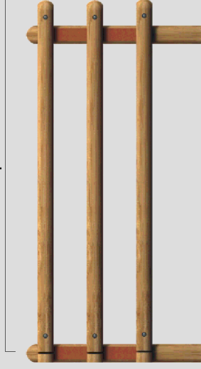
▶ Barriera con elemento finale Final module